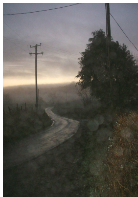
A rainy day in Lugatryna Lower, looking East towards Church Mountain as dawn awakes.

I have lived away from Dunlavin since going to college in 1993 and in the last 5 years, have lived in China, Kuala Lumpur and more recently in Perth, Australia. For me living in Dunlavin means living in a place where everyone knew one another where there is still a sense of community. Returning after a long absence, still gives you the feeling of really being at home. Some new faces