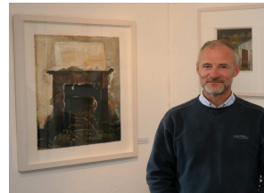
Jonathan Swift National